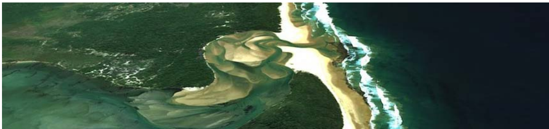
Kosi bay along the Natal north coast

Review data that constitute a threat to conservation, review TBCAs