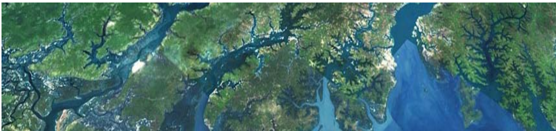
Mangrove swamps of West Africa

Reveal and promote the Atlas to the IAP of the world