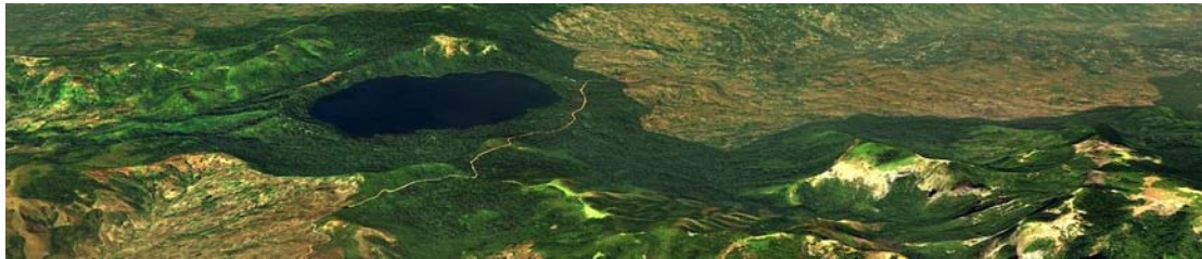
Volcanic lake in Cameroon surrounded by remnant highland forest

1 - REVIEW THE BASIS FOR TRANSBOUNDARY CONSERVATION Conservation manages the basic Ecosystem service for human benefit