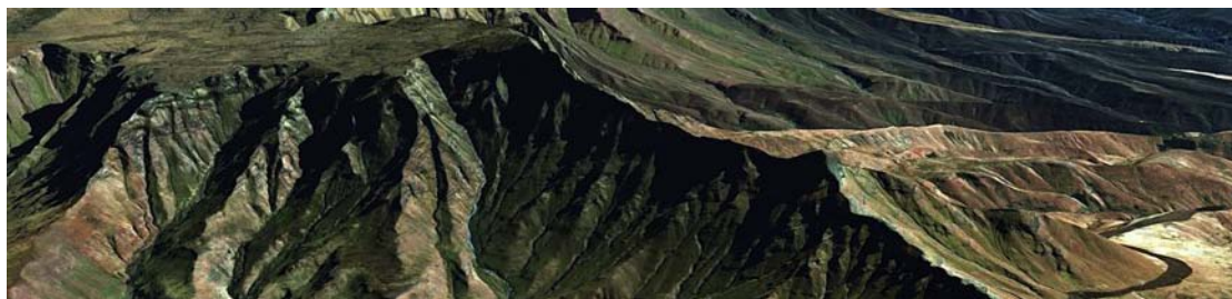
The basalt escarpment of the Drakensberg

2 - UNDERSTAND THE KNOWLEDGE BASE FOR TBCAS The data selection - Understanding, Management, Zoning concepts